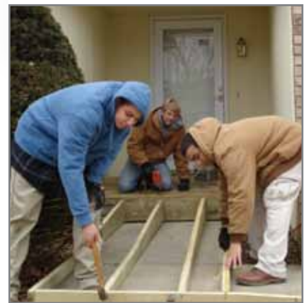
LUC Boys Ranch builds a wheelchair ramp for a hospice patient.

is important—especially when you know you’re going to die.”